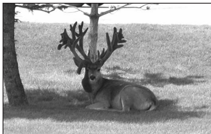
Future Wall Hanger

date the permit by slitting or punching holes in the permit accordingly.