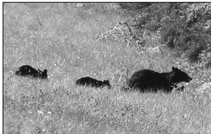
Mom and cubs - 2010

With fall right around the corner, many people are ready to go a field in pursuit of game. The Early Canada Goose Season starts September 1 and goes through September 15. The daily bag limit is 5 geese with a possession limit of 10 geese. Only approved non-toxic shot may be used. All shotguns must have a plug so the shotgun cannot hold more than three shells (including the chamber). Hunting hours are 30 minutes before sunrise to sunset. When a goose is harvested and before it is carried by hand or transported in any manner, the hunter shall vali-