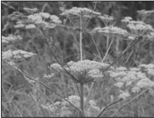
Wild Parsnips, a dangerous photo-sensitizer